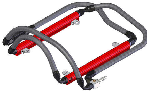
Example of “returnless” fuel system plumbing